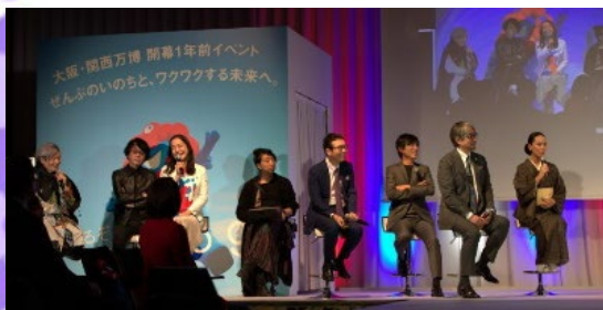
Talk session with eight producers