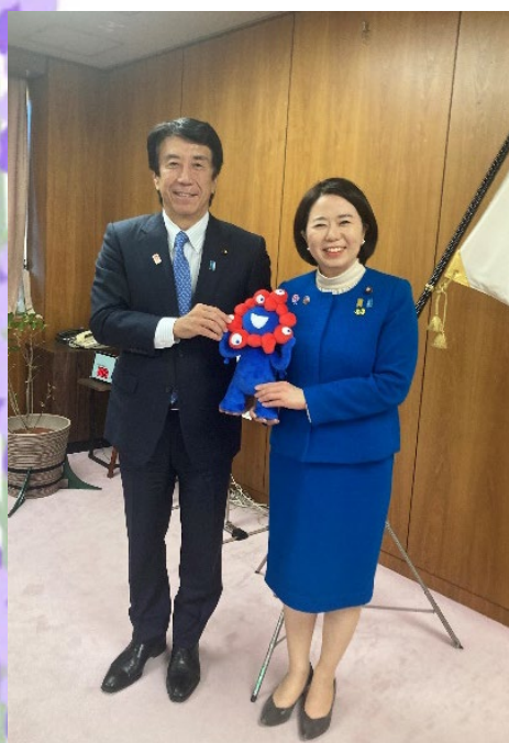
MYAKU-MYAKU with SAITO Ken, Minister of Economy, Trade and Industry and JIMI Hanako, Minister for the World Expo 20250

Since my appointment as minister last September, I've talked with all the producers of the Signature Pavilions that represent Expo 2025 Osaka, Kansai so as to be able to explain just how fascinating the Expo will be in my own words.