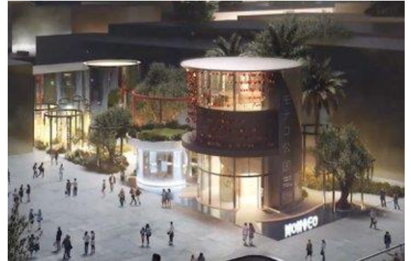
Image of the Monaco Pavilion

□ This week, the following pavilion unveiling and groundbreaking ceremony will be held.