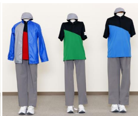
Management staff uniform