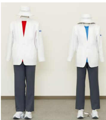
Association staff formal