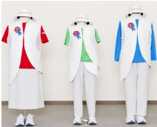
Venue service attendant uniform

<Reference> Official uniforms for venue staff, previously announced on 4/13