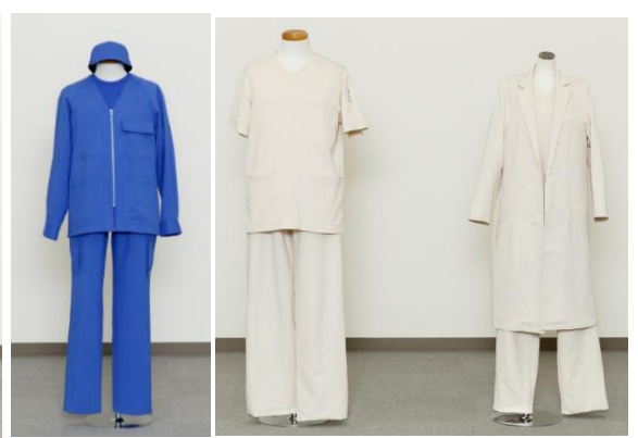
Cleaning and medical staff uniforms

( https://www.expo2025.or.jp/news/news-20240413-02 )