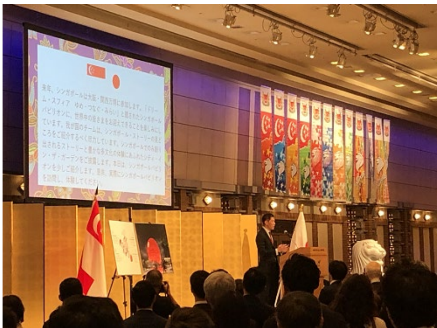
Singapore National Day Reception @ Imperial Hotel