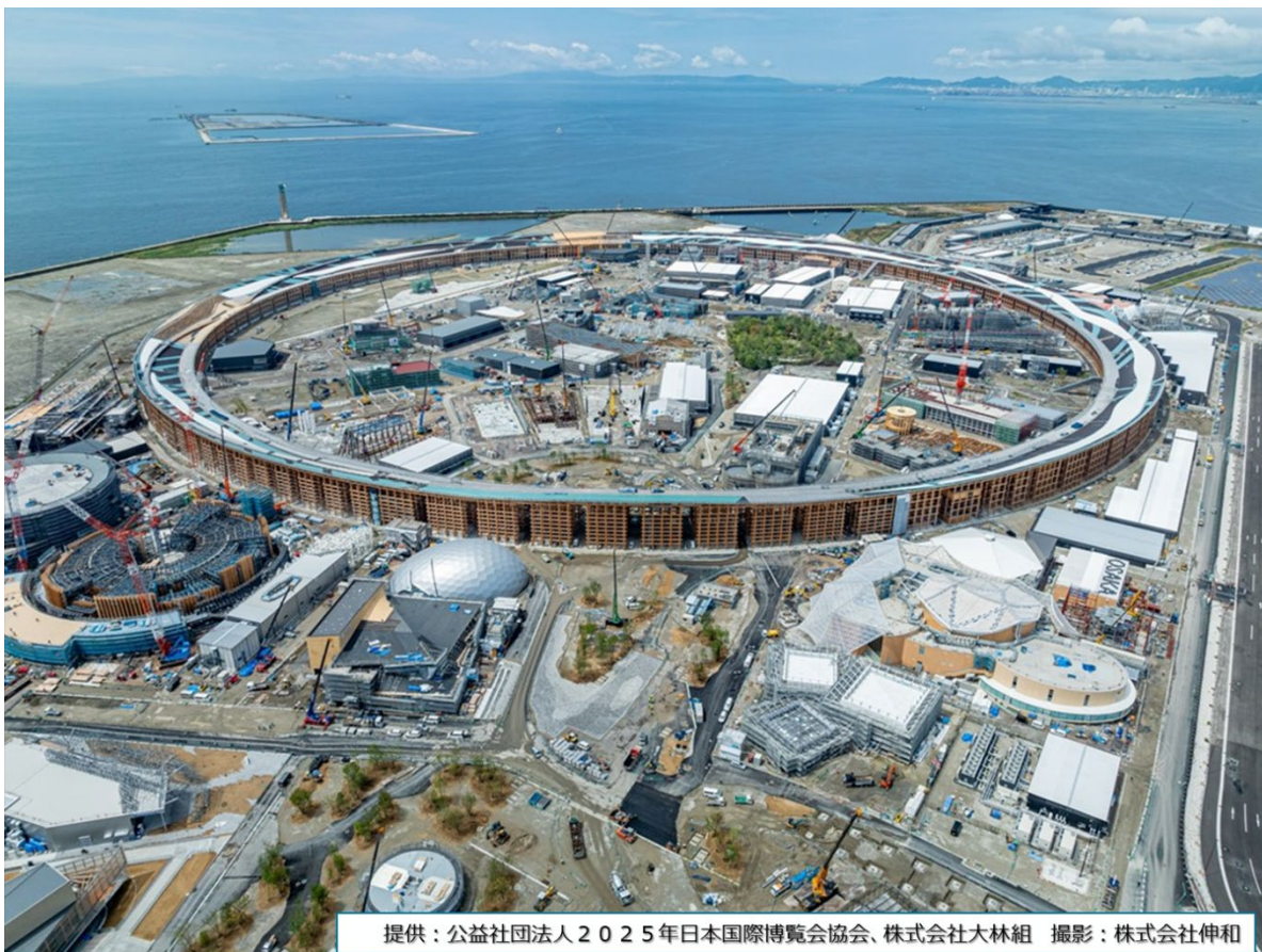
Perspective view of Grand Ring on August 20, 2024