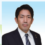
Hirofumi Sawai (Mayor of Matsubara City), Chairman, Mayoral Alliance for Expo 2025

The momentum-building project event held on July 26 was comprised of three parts: a study meeting, inspection tour of the Grand Ring, and international exchange/social gathering. Around 100 local government heads attended it from all over Japan—from Hokkaido in the north to Kyushu in the south. The event demonstrated that anticipation for the Expo is growing nationwide. The Expo is a golden opportunity for regions across Japan to play a leading role in regional revitalization. However, simply waiting for it to happen will change nothing. Japan's treasures are found in its regions: each region can contribute to regional revitalization by actively thinking about what they can do and act accordingly. Utilizing our nationwide network, we will continue to boost excitement for the Expo as well as energize Japan!