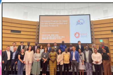
Exhibition plan presentation session by countries participating in the Expo

JIMI Hanako, Minister for the World Expo 2025