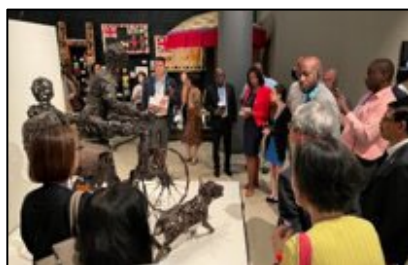
Inspection tour of a display facility